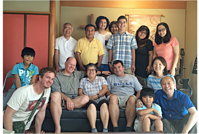
Oasis Church Family (Fall 2016)

Things have been going well at Oasis Church the last few months. As we are nearing the end of our 16-month Bible Study series on 1 Corinthians, it has been encouraging to see the people's desire to learn and grow through the study of God's Word. Our discussion of spiritual gifts in chapters 12-14 was especially fruitful, as people are finally embracing the idea that each member in the church family has a significant role to play in the body of Christ. We are slowly seeing a greater sense of responsibility and ownership when we gather together, as more and more people are seeking to make their own unique contribution to the growth of the church. PLEASE PRAY for continued growth and maturity of the Oasis Church family. May each of them have the courage and faith to fill the ministry role that the Holy Spirit has prepared for them. From the New Year, we will most likely begin to study one of the Gospels. PLEASE PRAY for us as we look to Jesus, learn from Jesus and seek to follow Jesus more.