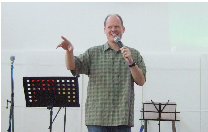
Giving the chapel message at KCS