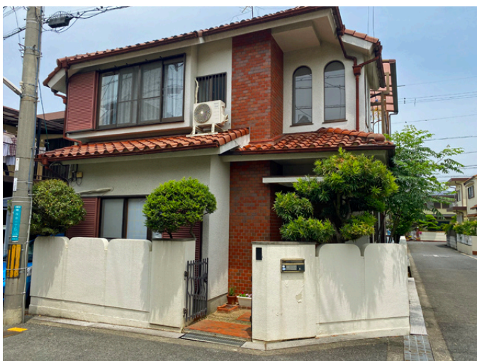
Our new home in Sakai, Osaka

After 13 years of living in Nara Prefecture, we are finally back in Sakai, Osaka. In early March we hired a moving company and asked them to move us on April 6th. As it turned out, the very next day is when the government declared the state of emergency! As always, God's timing is perfect! Thank you for your prayers during this whole moving process.