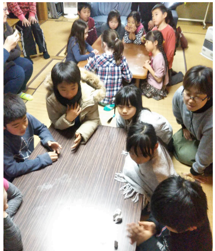
Game time at Kodomo Shokudo

PLEASE PRAY for Kodomo Shokudo. May we continue to build relationships with those who come each month. PLEASE ALSO PRAY for our April 1 st gathering. Being that it is Easter Sunday, we are planning to share the real meaning of Easter (along with an Easter egg hunt, of course!) May the Lord speak to the hearts of those who attend as they hear the Good News of the risen Jesus.